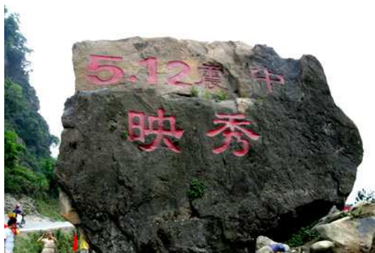
5.12 Wenchuan Earthquake Site

A 1-day pre-conference field trip is planned to visit Dujiangyan and the 5.12 Wenchuan Earthquake Site—Yingxiu. Dujiangyan is one of the World Cultural Heritage sites in central Sichuan Province, where visitors can observe a gravity irrigation system built in 250 B.C., which has made the Chengdu Plain a "Land of Abundance" with bumper crops every year irrespective of droughts or floods.