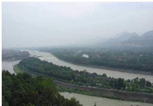
Dujiangyan Irrigation Project